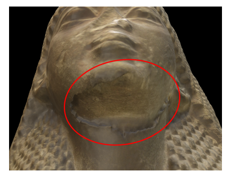
Figure 5: Misalignment on the chin area of the 'Bust' 3dDM.