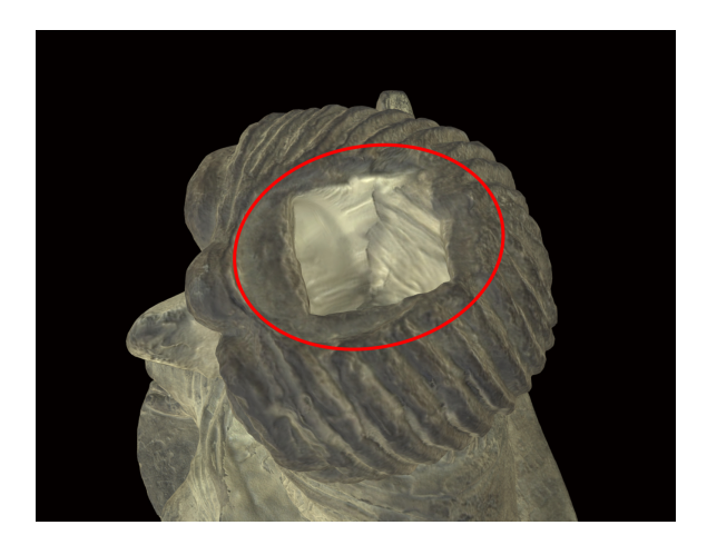
Figure 3: 'Horus' 3dDM showing texture inaccuracies due to missing geometry.

If the original object is not captured in a controlled lighting situation, the final 3dDM will have shadows and/or highlights present on the