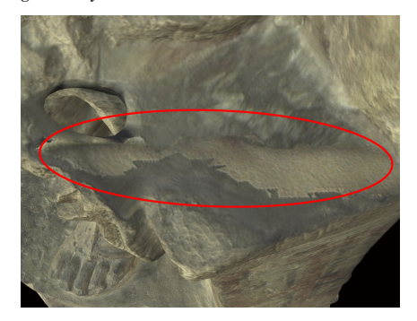
Figure 7: Texture inconsistency on the 'Horus' 3dDM.