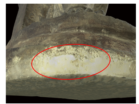
Figure 9: Overexposed area on the side of the base of the 'Horus' 3dDM.

object during capture (e.g. gallery light, harsh sunlight) permanently baked into its texture [PHHF16]. Similarly, if equipment such as a structured light scanner is used for acquiring the 3dDM, artificial brightness differences on the 3dDM's texture can occur if the scanner was held too closely to the object's surface. Brightness inaccuracies can be observed on the base and the plinth of 'Horus' (Figure 9).