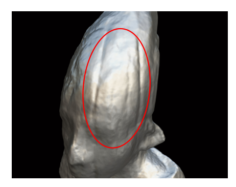
Figure 4: Cracks as displayed in the 3dDM's geometry.