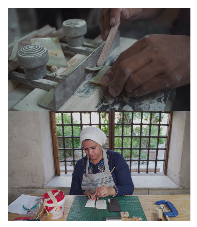
Figure 2: Visual material documenting processes of inlay woodwork craft.

Our approach, which was deployed during the COVID pandemic in 2020/2021, involved the co-design and co-production of photographic and film material. During this period, researchers were unable to travel to Cairo to acquire data. Hence, in collaboration with local crafters, the best approach for filming and digital photography was decided. Crafters who had been involved in developing the knowledge structure collaborated with a local filmmaker to produce extensive material for each of the processes and stages of inlay craft based on a clear and comprehensive co-designed structure. Figure 2 presents two photographs acquired during digital documentation, for the stages of Cutting and shaping the inlay material illustrated in the top part, and for Joining and fixing the inlaid product illustrated in the bottom part. Two films were produced documenting both the traditional and modern techniques of the inlay process execution.