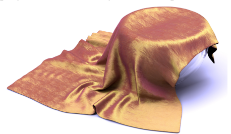
Figure 3: Full rendering in Mitsuba with our BTF plugin.

Compression & Rendering The data processing cuts the size by a factor of a thousand (raw data in the order of terabytes), but the uncompressed BTF datasets still take up too much storage for practical rendering. We use our compression scheme [2] to further reduce the size to the order of one megabyte. We render directly from the compressed representation, with parallax mapping to reverse the height field compensation.