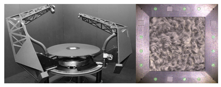
Figure 1: Left: Our BTF capture system. Right: Sample holder.

Bidirectional Texture Functions [1] are data-driven appearance models that can accurately reproduce the visual appearance of real-world materials. Practically, BTFs are stored as a stack of 2-dimensional textures that describe a material's appearance at a given set of light and view directions. A typical BTF dataset contains up to tens of thousands of light-view combinations, for hundred thousands of texels. Different BTF measurement setups have been proposed, ranging from camera arrays [5] to mirror-based or kaleidoscopic systems [4], balancing hardware, acquisition time, computation and storage costs in different ways. We present a custom system with unique properties, developed for a commercial project.